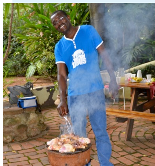
Joseph BBQ's chicken for our students.