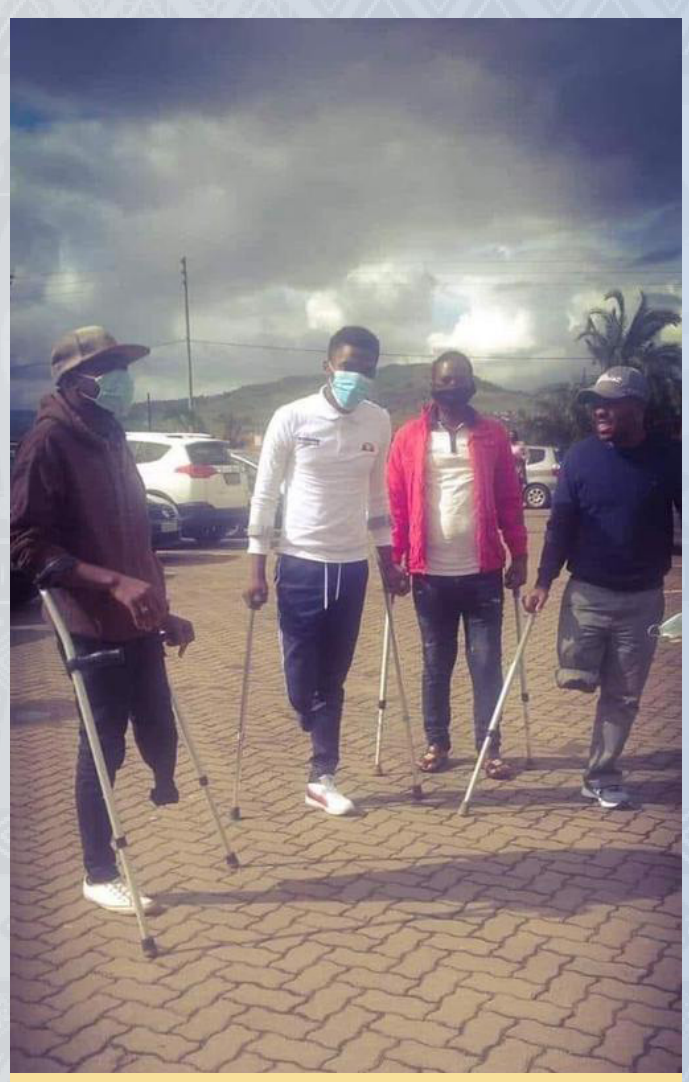
Young men who have lost limbs from gun shot wounds in July rioting

As the universe would have it, things erupted again about one day after I arrived! The higher level of organized and legal