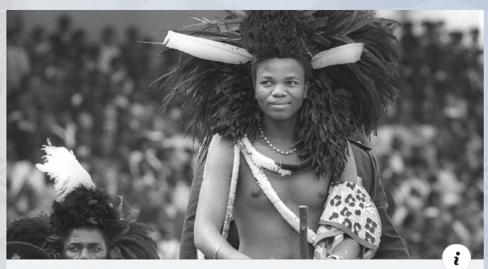
TIMESLIVE.CO.ZA 'A conditional love': King Mswati's long reign became a sleepwalk into disaster

Now these young people have increasing access to the internet and can see how much of the western world are living. Then they see their own conditions, and those of their extended families and neighbours. Then they see their king and his excesses, iconized by every generation before them, and they wonder why and how such a situation can exist in these times.