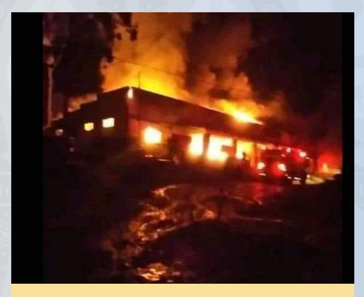
School Building burning

Most sadly, somehow students, down to the elementary level, were also drawn into the fray. They were seen burning their own desks, chairs and buildings. They would make ridiculous claims for their needs from a new democracy, such as "we need pizza for lunch!" Some speculated that the teachers were actually behind the actions of the students. Consequently, shortly after I arrived, the schools closed for the balance of my stay, due more to the protests than to Covid.