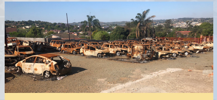
Rioters in July destroyed this entire lot of cars for sale

From early July, roughly 600 people are still incarcerated. They estimate 80 students and young adults have been killed by the country's own military and police. It is widely accepted that their bodies have been burned in a mass grave.