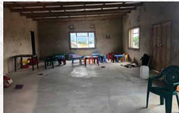
Moya inside new preschool

You can't come to Eswatini without seeing it. There will be at least two days where we tour the rural areas, view other projects with women and enjoy Eswatini's mountainous beauty.