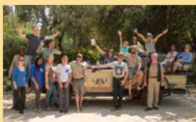
Open Game Vehicles