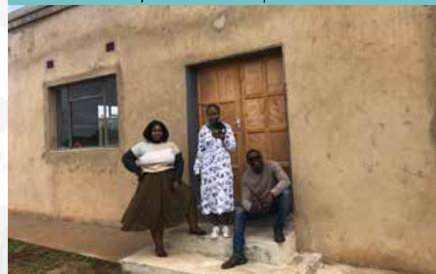
Moya staff new preschool