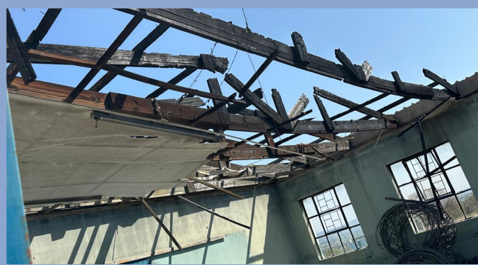
Mavula before & after!

Two very, very rural schools received major structural upgrades and face lifts. Both resulted in large numbers of students returning to attend school in their home areas. These projects are favourites of ours for several reasons. The cost is relatively low ($10-15k CAD.). The results are very satisfying and rewarding to the eye. It restores pride to the village residents. And most importantly, students return to the classroom.